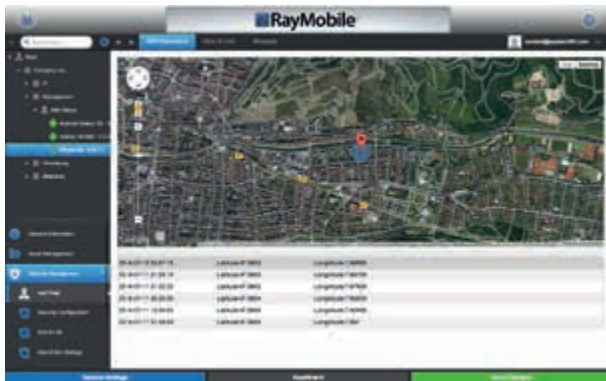
GPS Information and Alert

smartphones and tablets to strengthen their job roles within the company. Security of data presents companies a major challenge. With RayMobile and its intuitive management console, it is very easy to manage all devices as well as stored data, for example smartphones are configured by the IT department to receive business e-mails or to access the company-wide intranet. The RayMobile security management Dual Persona separates business data from private data. It guarantees a clear management between two independent end-user environments. High productivity and a flawless use of smartphones and tablets are promised by RayMobile.