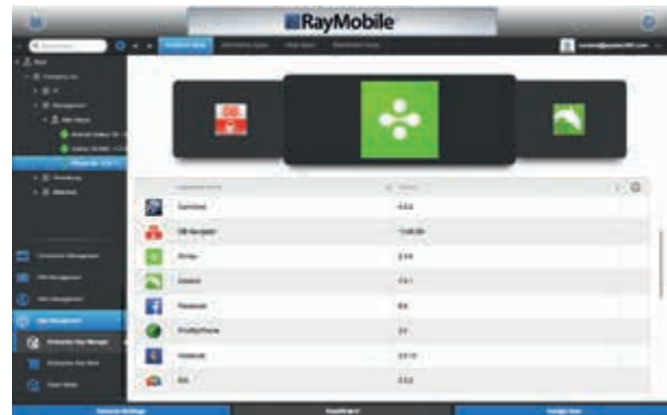
Manage your applications on mobile devices with RayMobile